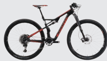
ARCTEC D 9