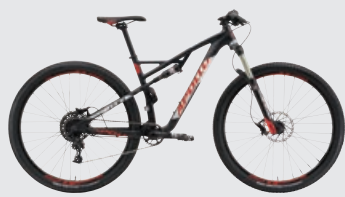
XPERT D 10