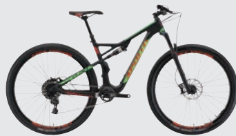
XPERT D 20